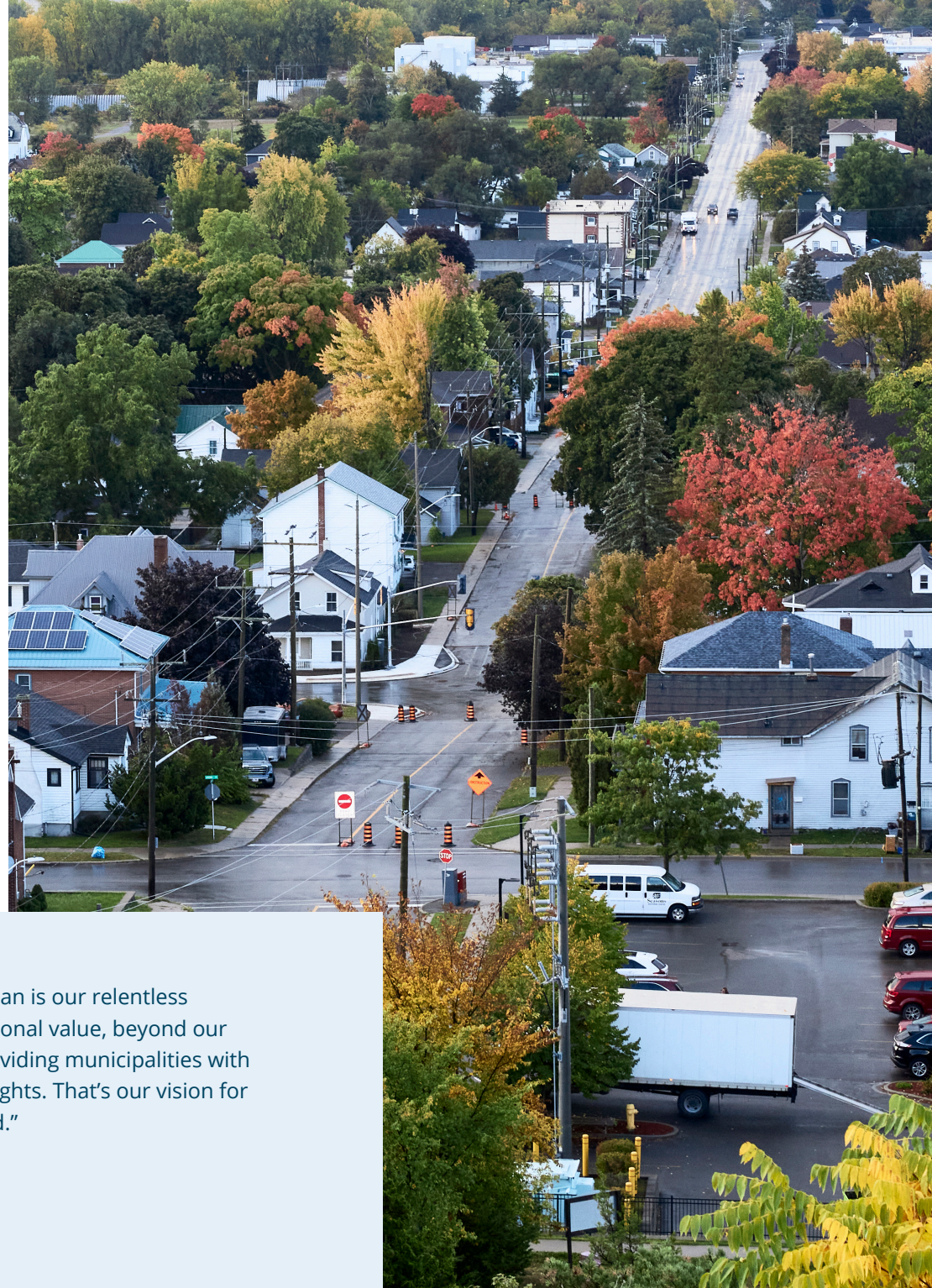
Nicole McNeill MPAC President

"The cornerstone of our 2021-2025 Strategic Plan is our relentless focus on delivering the greatest possible additional value, beyond our foundational assessment role. That means providing municipalities with value-added data, analytics and actionable insights. That's our vision for property assessment in a post-pandemic world."